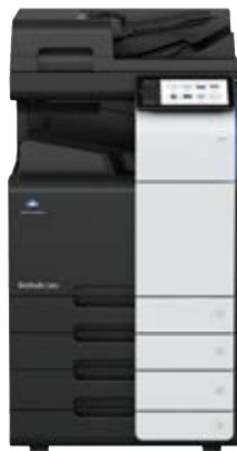
bizhub i-Series C360i

So as your business grows, we will grow with you – seamlessly linking people and places to give a new dimension to document workflow and security management.