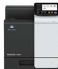
bizhub i-Series C4000i