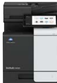
bizhub i-Series C4050i